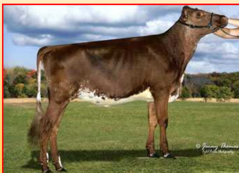
Dtr: Green Acres Lilyhill Twix