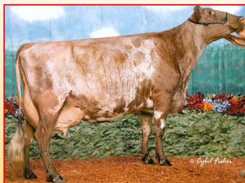
Dam: Gold Mine Poppys OT Kay - EX95