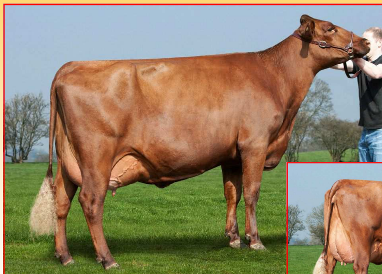
Dam: Cotonhall Tulip 2nd - VG87 3YR