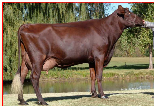
Dam: Innisfail Ko Lily 1016

Sire: Hilltop Academy - EX92 MGS: Kuszmar Alfairs Othello Dam: Innisfail Ko Lily 1016 320D 20,390M 4.0% 809F 3.0% 603P MGD: Innisfail RB Lily 531 - VG86 365D 22,750M 3.0% 678F 3.0% 690P