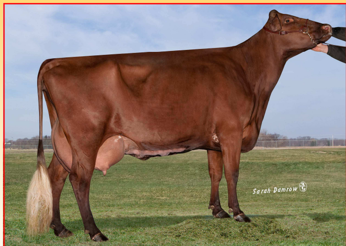
Dam: Ecuafarm Koyote Reina - EX93 2E

Sire: Ecuafarm Peris Kaiser - EX91 MGS: Gold Mine Ebrose Kao Koyote - VG88 Dam: Ecuafarm Koyote Reina - EX93 2E 365D 25,770M 3.7% 965F 3.2% 816P MGD: Ecuafarm Dusty Glen Royal - EX90 365D 31,710M 3.9% 1237F 3.2% 1018P