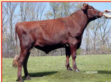
Ecuafarm Kaiser Royalty