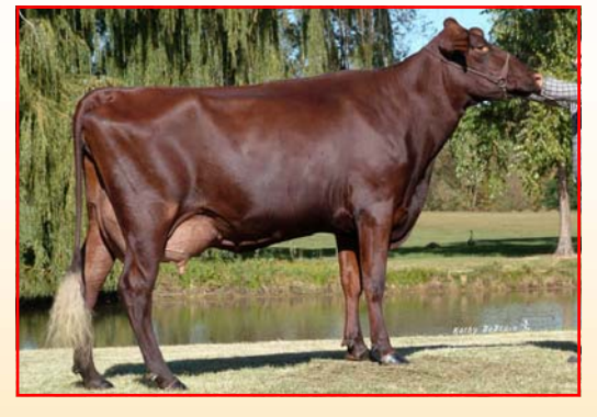
Dam: Innisfail Ko Lily 1016

Code: LILYHILL USA Rego #: 461776 Price: $22.00 + GST Per Dose