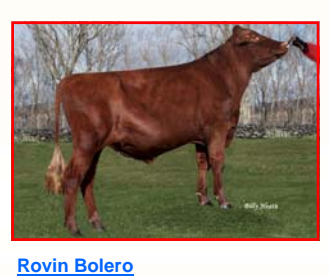
New Release Sire From The USA

Sire: Mysha-Wo Advent Liriano - ET MGS: GMC Rebel Logic - ET EX90 Dam: Rosecrest RL Barb - EX90 353D 25.560M 5.0% 1287F 3.2% 811P MGD: Rosecrest JU Bara - EXP VG85 365D 17,850M 3.6% 641F 3.3% 579P