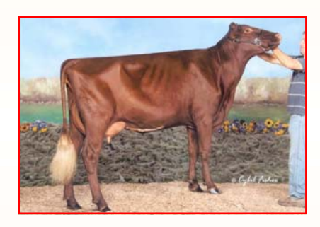
Dtr: Millcreek Logic Angel