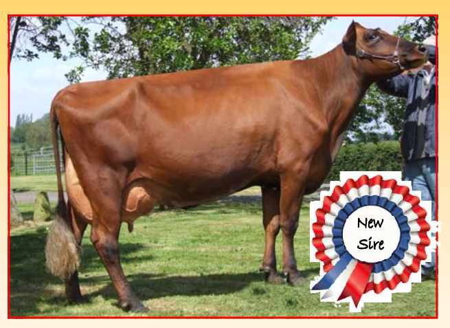
Dam: Rodway Marie 68th - EX92

Sire: Drisgol Madonnas Prince - EX96 MGS: Rodway Rebel Prince Dam: Rodway Marie 68th - EX92 305D 10,543M 3.21% 338F 3.24% 341P MGD: Rodway Marie 63rd - EX93 305D 8,488M 3.14% 266F 3.20% 271P