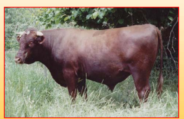
Turramurra Lord Barrington 2nd

PGS: Theale Lord Barrington 4th Sire: Kinsel Lord Barrington PGD: Stourhead Barrington Empress 116