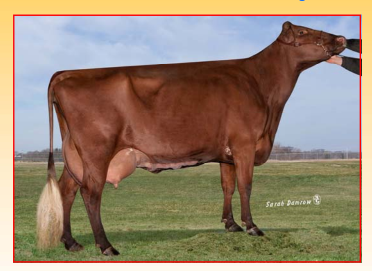
Dam: Ecuafarm Koyote Reina - EX93 2E

Code: KAISERROYAL USA Rego #: 68307222 Price: $28.00 + GST Per Dose