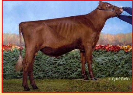
Spungold-R Prince of PA - ET ~Grand Champion Bull All-American & WDE 09