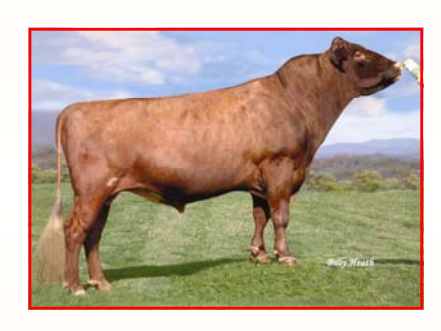
GMC Rebel Logic - ET