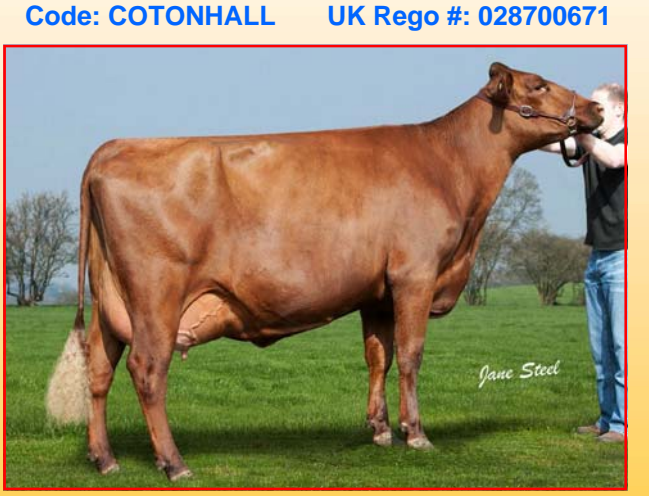
Dam: Cotonhall Tulip 2nd - VG87 3YR