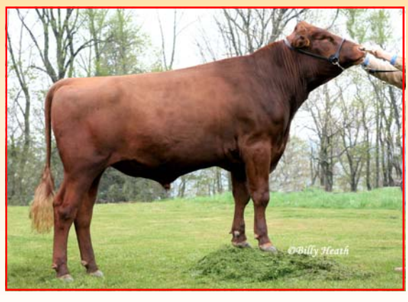
Kulp-Gen OK Acdmy Adam - P ET

Sire: Valley View Meghans OK Academy - EX90 MGS: Wildwood Kay's Derek - ET Dam: Rovin Derek Ali Accent - P EX92 363D 22,010M 4.7% 1027F 3.5% 769P MGD: Rovin Alise Clay Ali - P 365D 23,242 3.9% 915F 3.1% 710P