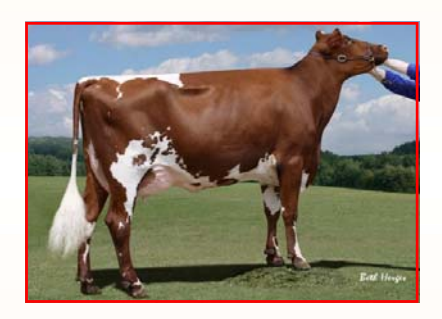
Dtr: Spungold-R Logic Precious - ET VG88

~A2/A2 Sire with a strong Fat Deviation at +0.20%. ~He Continues to make show winning daughters.