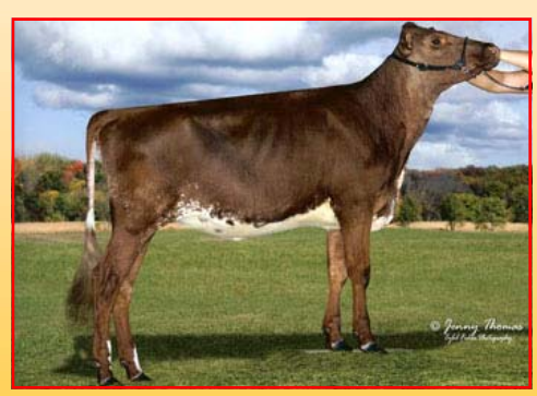
Dtr: Green Acres Lilyhill Twix