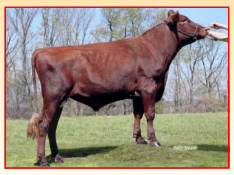
Ecuafarm Kaiser Royalty

Sire: Ecuafarm Peris Kaiser - EX91 MGS: Gold Mine Ebrose Kao Koyote - VG88 Dam: Ecuafarm Koyote Reina - EX93 2E 365D 25,770M 3.7% 965F 3.2% 816P MGD: Ecuafarm Dusty Glen Royal - EX90 365D 31,710M 3.9% 1237F 3.2% 1018P